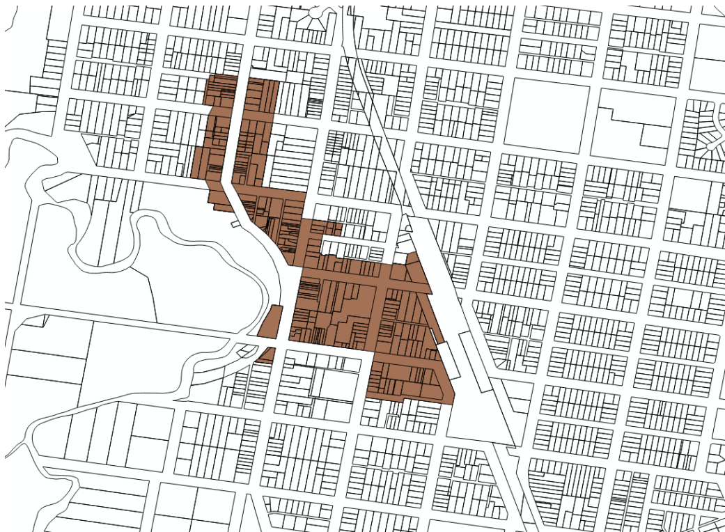
Figure 2: Additional Permitted Use 18